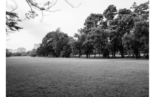
to the park