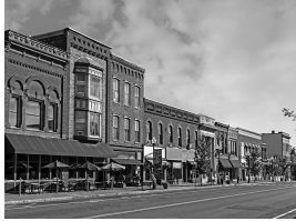
to a town

Where do they want to go at the weekend?