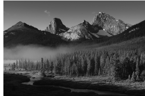
to the mountains